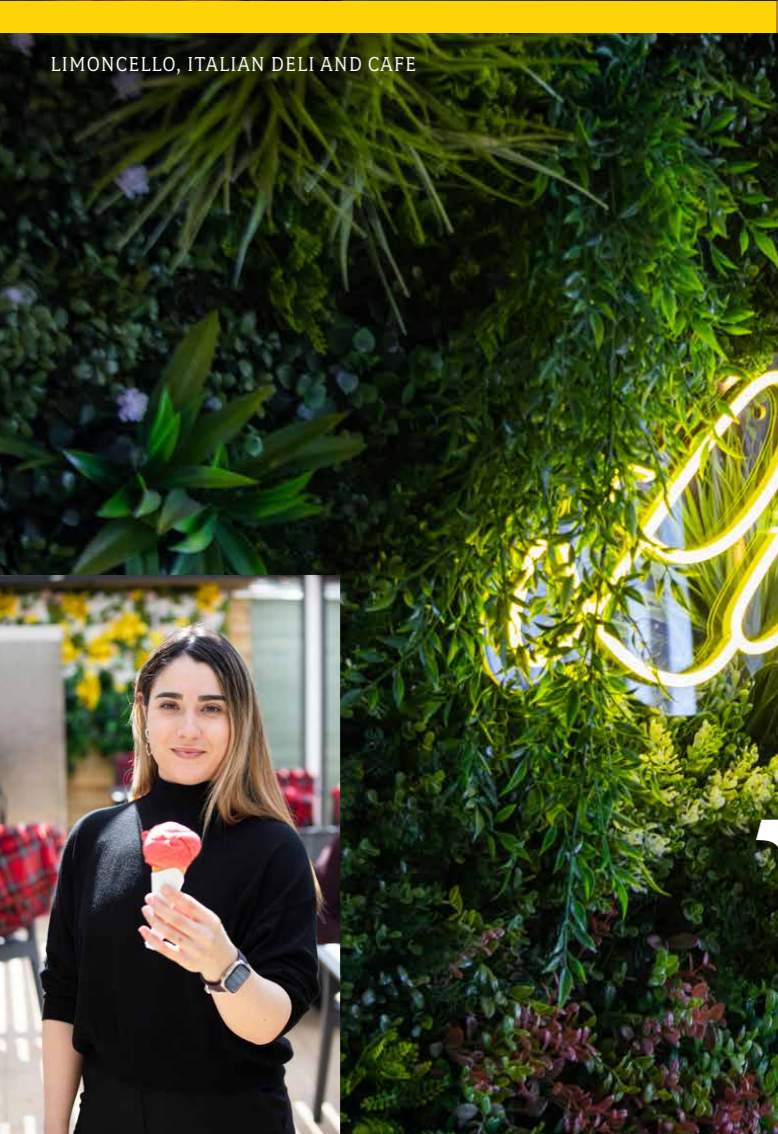
LIMONCELLO, ITALIAN DELI AND CAFE