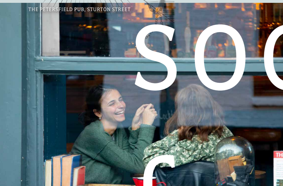
THE PETERSFIELD PUB, STURTON STREET