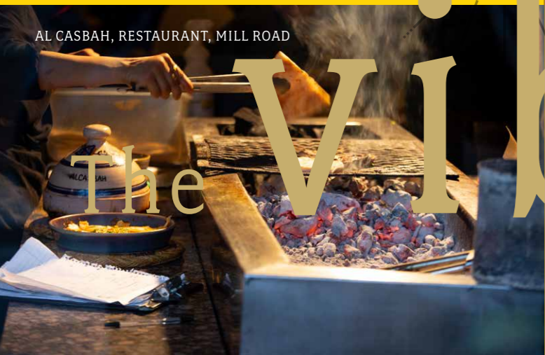
AL CASBAH, RESTAURANT, MILL ROAD