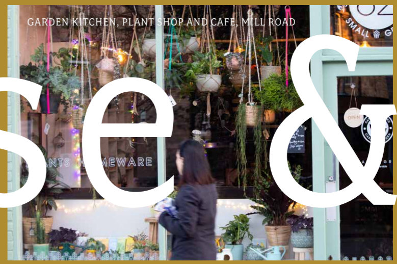
GARDEN KITCHEN, PLANT SHOP AND CAFE, MILL ROAD